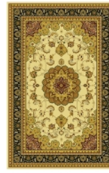
V 109.166 ES4