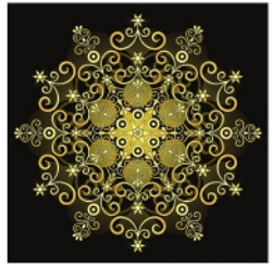
H 127.127 ES1