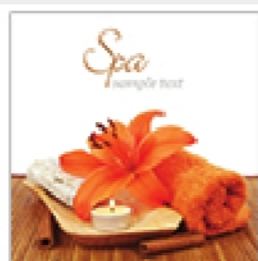
V 175.177 SPA9