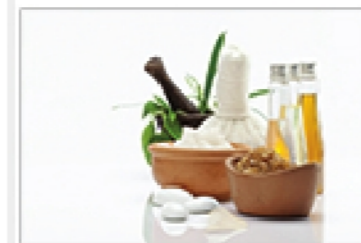
H 228.152 SPA6