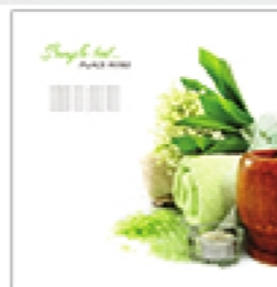
V 191.197 SPA11