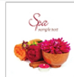
V 102.108 SPA7