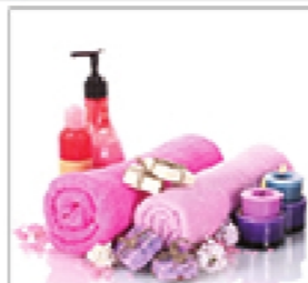
H 167.154 SPA4