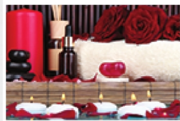
H 131.88 SPA2