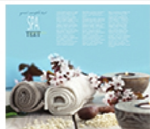
H 142.127 SPA3