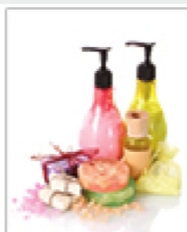
V 175.216 SPA10